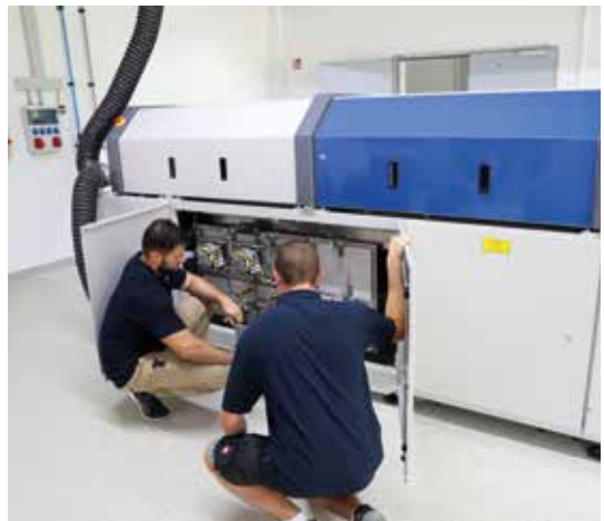
In all user training sessions, the focus can be placed on maintenance, enabling your employees to perform these tasks independently.