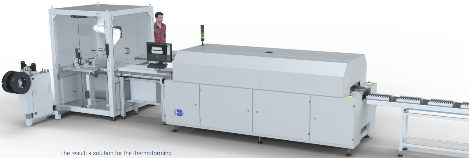
The result: a solution for the thermoforming of flexible parts